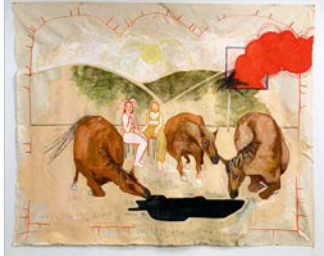
Amy Bravo Meeting at the Watering Hole 2020 acrylic and wax pastel on canvas 78" x 100"