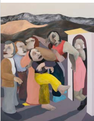
Hojan Shout to the Mountain 2019 acrylic on canvas 78" x 64"