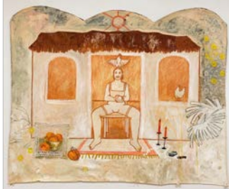
Amy Bravo Santera 2020 acrylic and wax pastel on canvas 57" x 70"