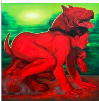
Amanda Ba Running on All Fours Towards the Future 2021 oil on canvas 100 x 100 cm