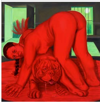
Amanda Ba 狗女人放狗屁 / Dog Woman Releasing Dog Fart / The Bitch is Non-sense 2021 oil on canvas 100 x 100 cm