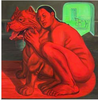
Amanda Ba My Beast, All Mine 2021 oil on canvas 100 x 100 cm