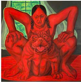
Amanda Ba Bitch and Bull 2021 oil on canvas 100 x 100 cm