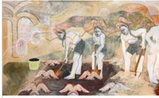
Amy Bravo Vamos A Cosechar 2021 acrylic, graphite, wax pastel and found fabric on unstretched canvas 97.5" x 57"