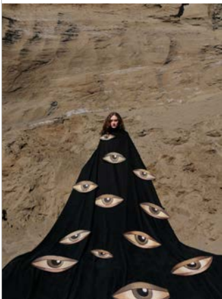
Alisa Gorshenina Digital photo from the series "Huarealism" 2020