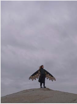
Alisa Gorshenina Digital photo from the series "Huarealism" 2021