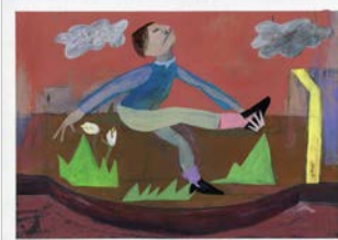
Hojan The Truman Show 2021 acrylic, oil pastel, and pencil on paper 9" x 12"