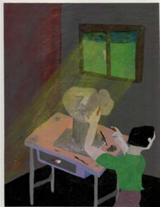
Hojan Self Portrait Work in Progress 2021 acrylic and pencil on paper 12" x 9"